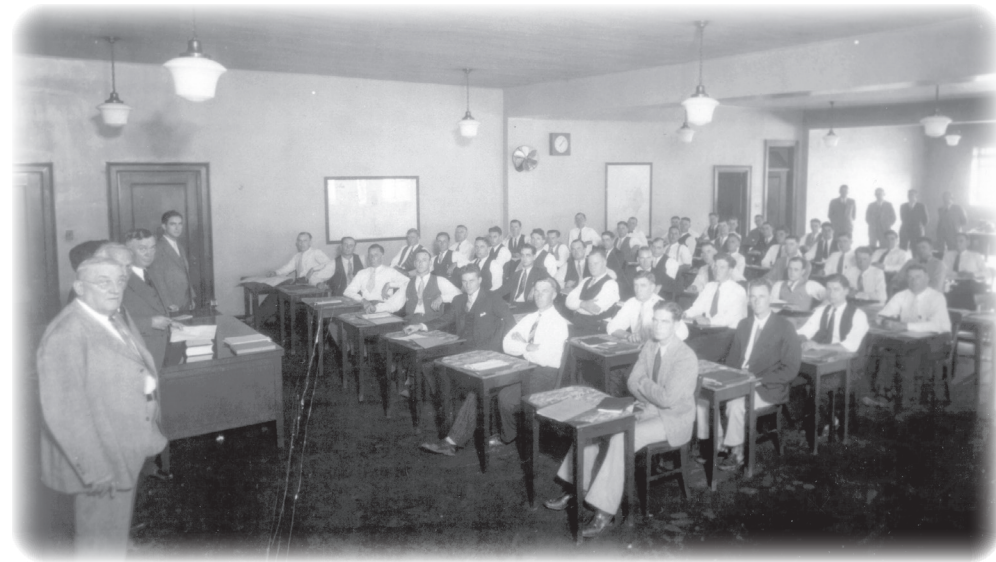
The first class of recruits are shown in a classroom at St. Louis Police Training Academy in 1931.

The motor vehicle fleet for these first patrolmen consisted of 36 new Model A Ford Roadsters, a Ford sedan, a Plymouth sedan, an Oldsmobile, a Buick, three Chevrolets, and 12 Harley Davidson, three Indian, and two Henderson motorcycles. The Roadsters, which cost $413.18 each, had twin Klaxon horns, a spotlight, a fire extinguisher, a first aid kit, and an electric "Patrol" sign behind the right side of the windshield. All vehicles had