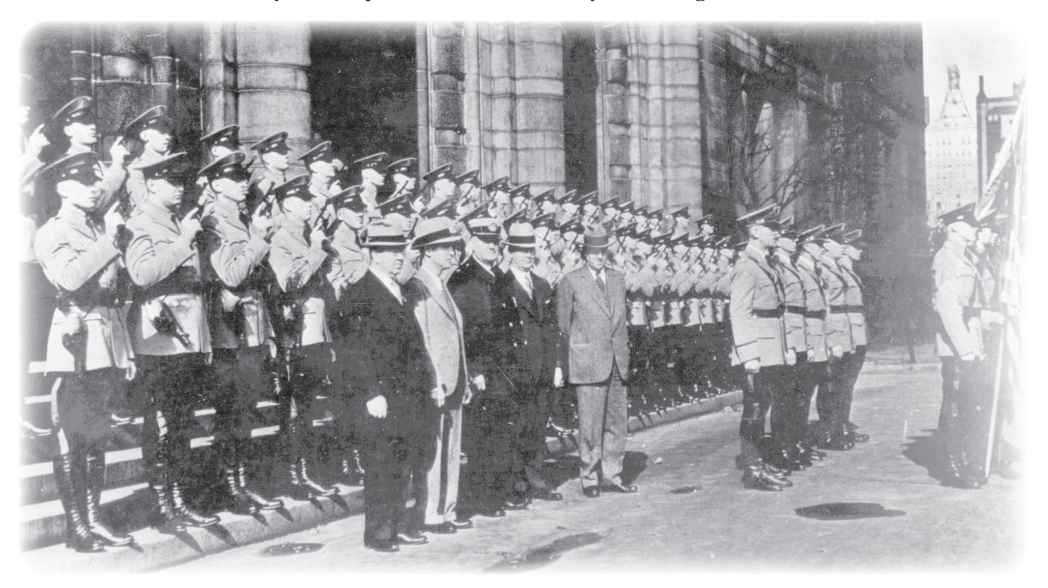
Pictured is graduation day for the First Recruit Class. The new troopers had one week to prepare their move to their assigned locations.

A month after the original Highway Patrol class completed training in St. Louis, it was Christmas time. Many of the members faced the prospect of a lonely Christmas away from their loved ones, having just moved to new areas where they had recently been assigned. In what had to be one of the