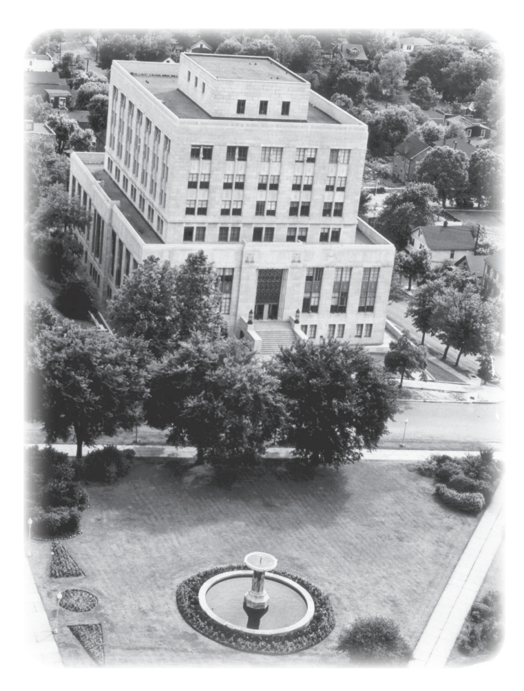
In 1938, General Headquarters was moved from the Capitol to the Broadway State Office Building in Jefferson City.

Headquarters was moved from House Room 309 in the Capitol to the Broadway State Office Building in Jefferson City.