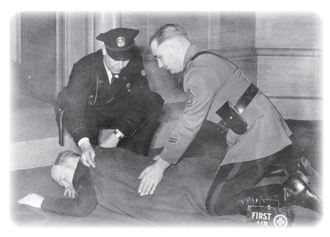
Members received First Aid training for the first time in 1936. The Red Cross emblem was added to the uniform above the left elbow.

General Order #10, issued March 5, required officers to carry "civilian badges" while off duty. Any officer losing the badge would be fined $10 plus the cost of replacing the badge. The civilian badges were recalled April 10, 1947. Failing to return the badge resulted in a $6 fine; loss of a Patrol commission card was to result in a $10 fine. March 1, 1948, the civilian badges were reissued, and the $10 penalty for losing it was reinstated.