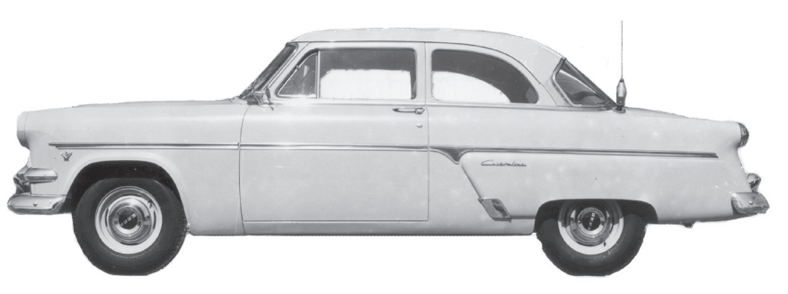
Above is a white, 1954 Ford Interceptor.

Members of the Highway Patrol did an outstanding job in helping to quell the riot. The Patrol's response to the crisis was credited with containing the violence within the walls and pre-