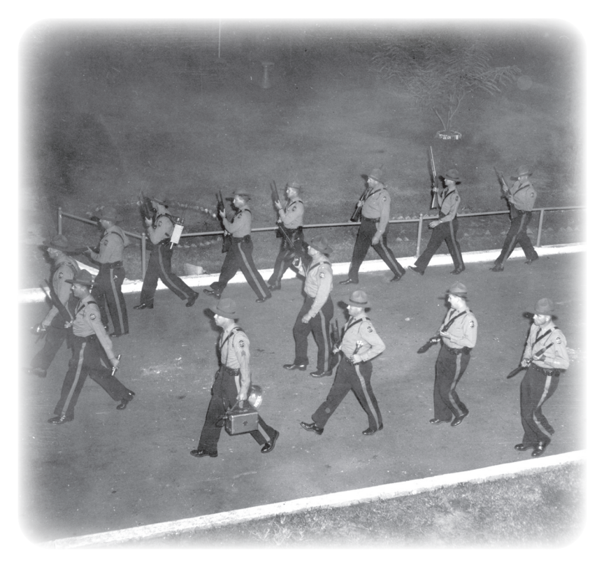
On the morning of September 23, 1954, two squads of troopers used wedge formations to enter "B" and "C"