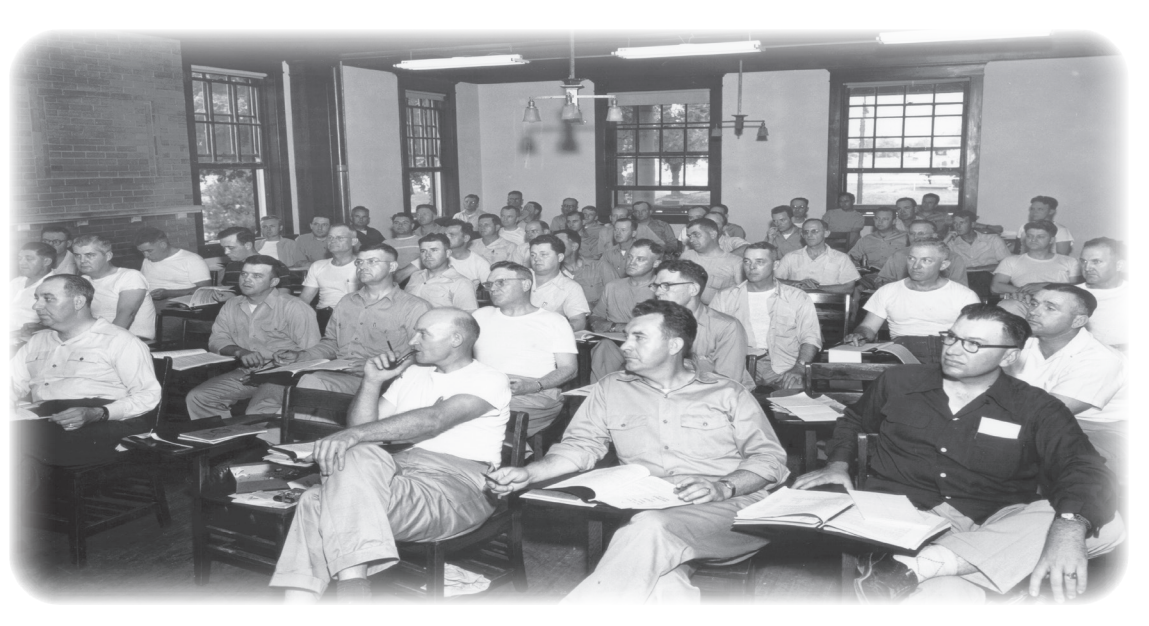
The first drivers license examination training school took place in Sedalia in 1952.

A few of the highlights of 1951 included: all state employees were placed under Social Security on January 1; emergency red lights on patrol cars flashed on and off for the first time instead of remaining constantly lighted; Troop G Headquarters in Willow Springs moved to a new and larger building on the same grounds.