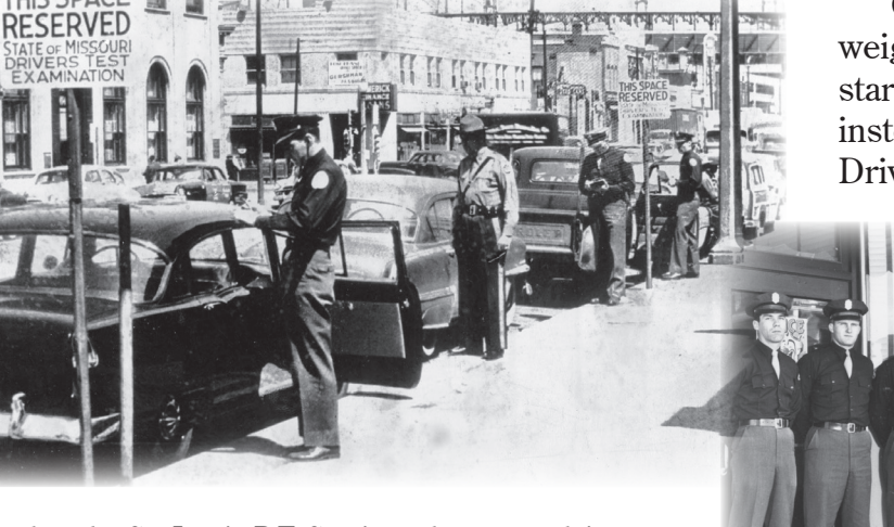
Assigned to the St. Louis DE Station, these new driver examiners in brown uniforms began admistering tests in 1955.

On October 1 members, radio operators, weight inspectors, and driver examiners started receiving six days leave each month instead of five. The Patrol sponsored State Driver Education Contest was discontinued.