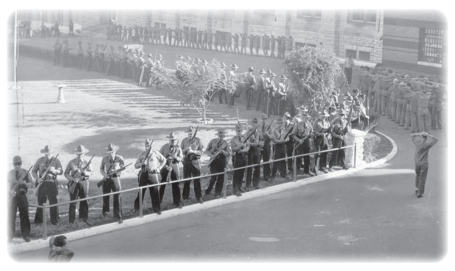
Nearly 300 members of the Highway Patrol were on duty during the state penitentiary riot. Here, prisoners are being taken to F and G Dining Hall, a corner of which is seen in the far right of the photo. B and C halls are in the background.