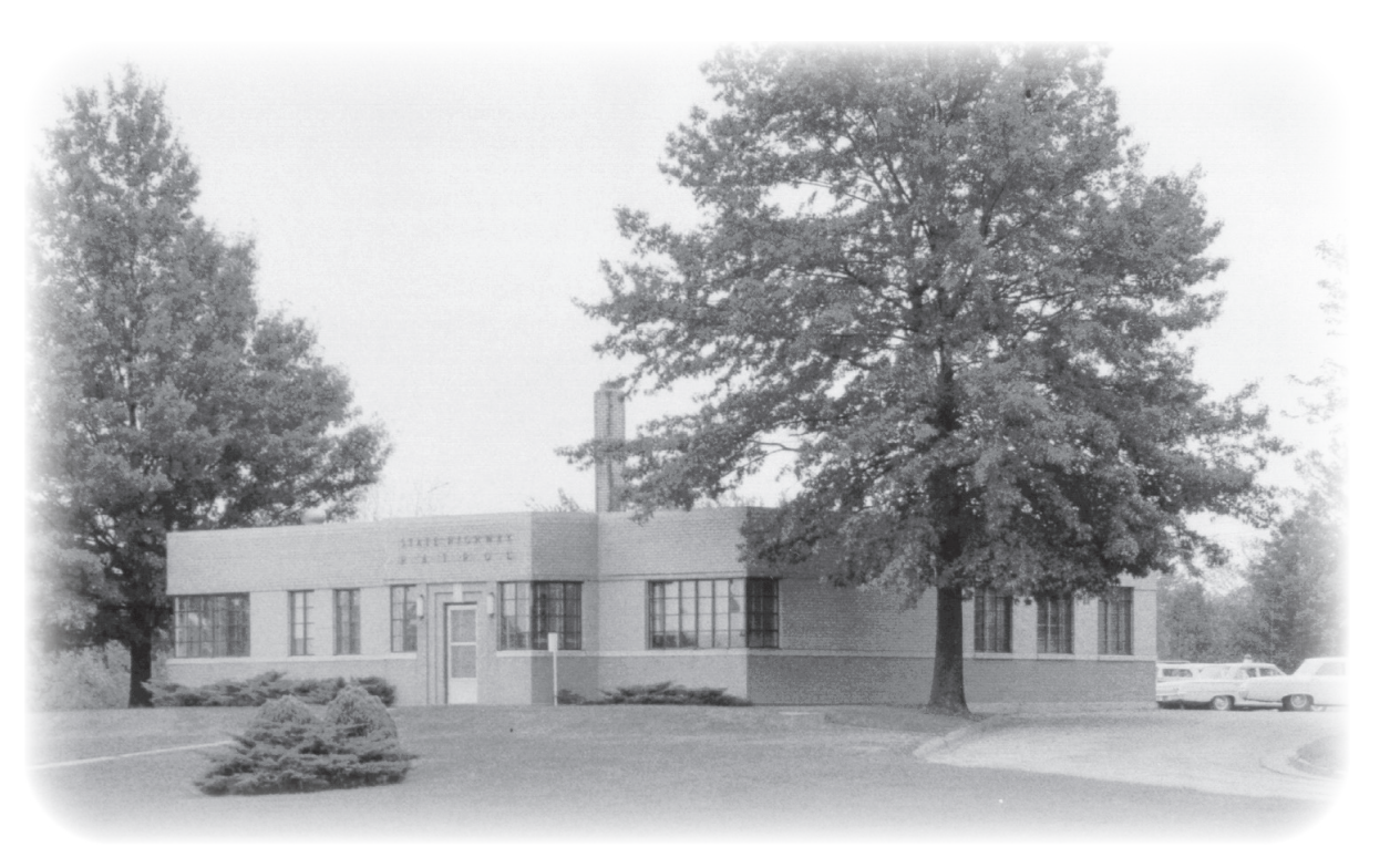
On December 20, 1964, an open house was held to celebrate the new Troop B Headquarters building in Macon, MO.

became very specialized. Crowd control was the major