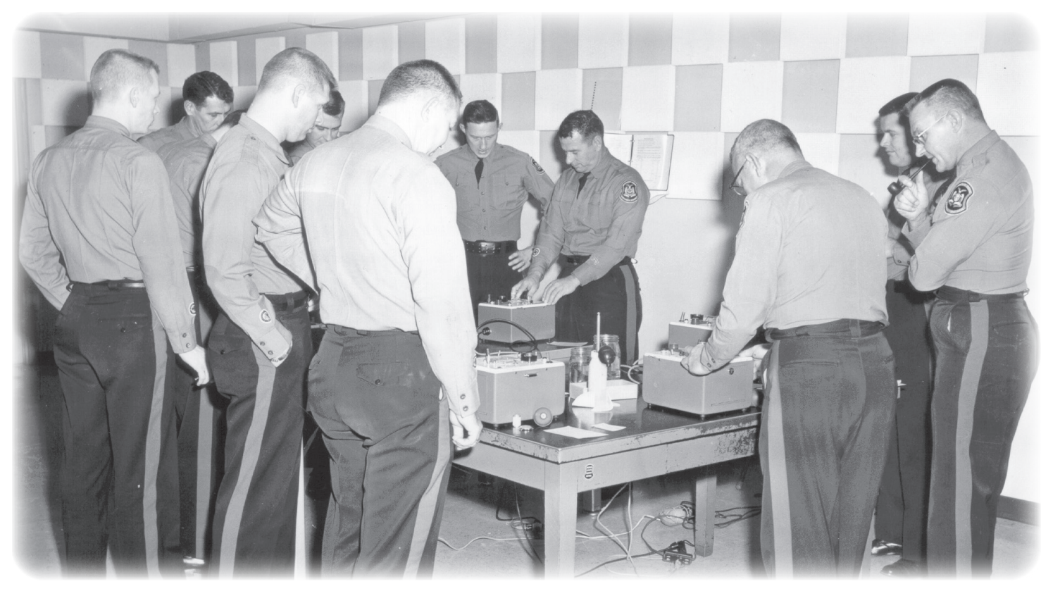
Troopers attended breathalyzer training in 1965.