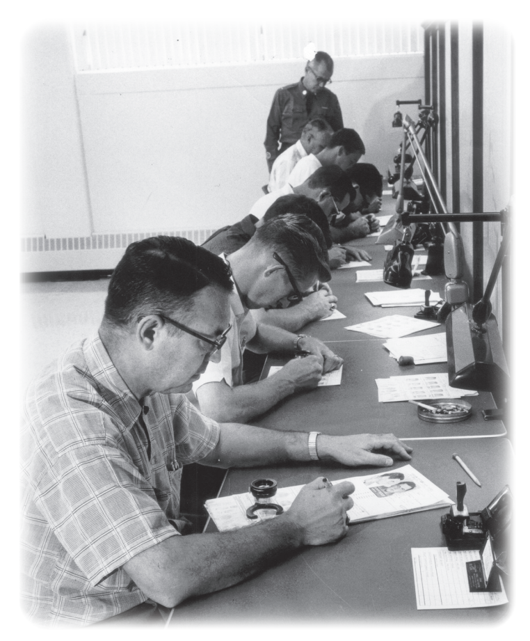
This photo of the Fingerprint Section at General Headquarters was taken in 1965.