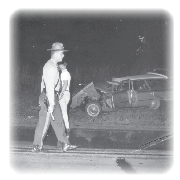
A trooper works a double fatality traffic crash near Clinton in 1962.

In April, a statewide private line teletype network was installed, permitting communications between the troop headquarters, General Headquarters, and the Motor Vehicle Bureau automatically by means of perforated tape.