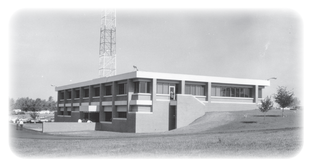
The new Troop C Headquarters in Kirkwood, MO, was completed in 1967.