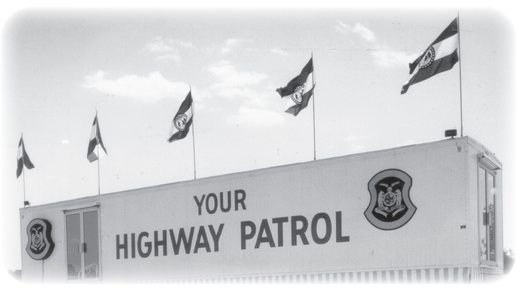
This educational exhibit trailer helped the Patrol share safety messages with the public in 1967.

power houses in St. Joseph and Springfield. Construction began in December on a new 20,000-square foot troop headquarters in Lee's Summit.