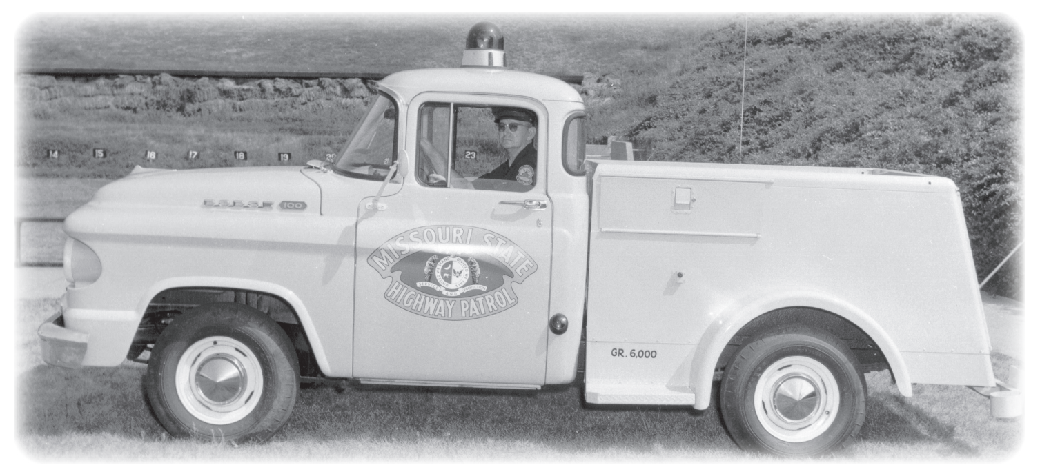
The Patrol placed four portable commercial weigh scales like the one pictured into operation in 1960.

The fleet of 1960 Dodges was the last Patrol fleet to be composed of one make of automobile; all were either white or light blue.