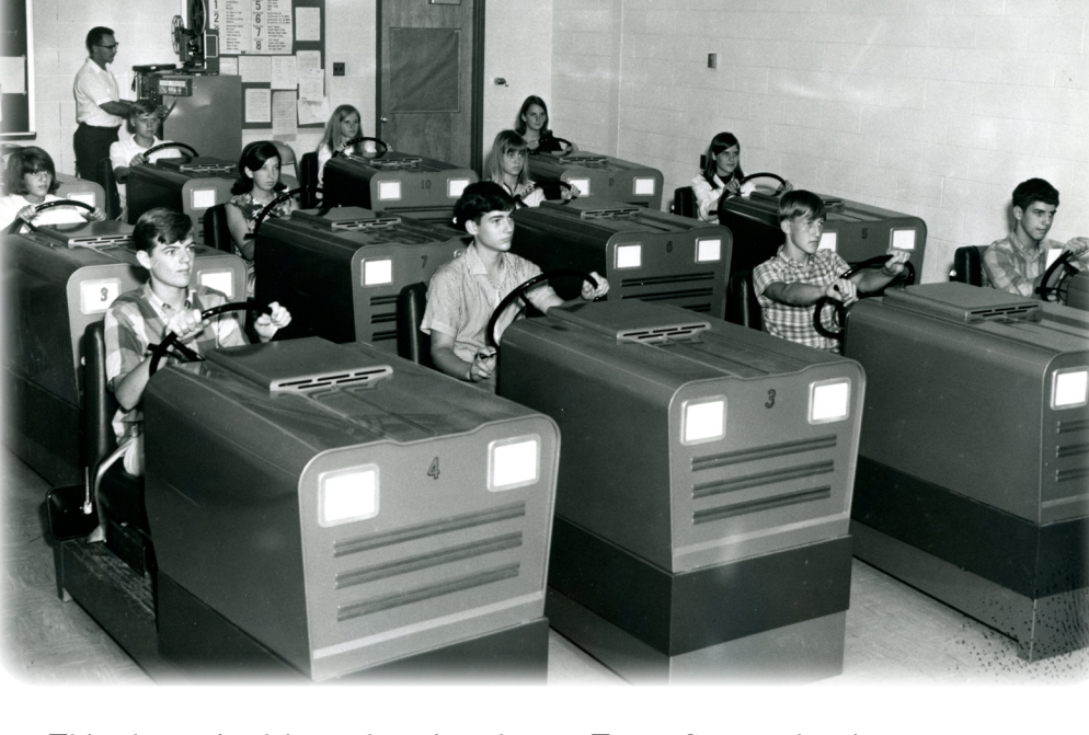
This photo of a driver education class at Troop C was taken in 1966.

Several building projects were completed including the new Troop C Headquarters in Kirkwood, an addition to Troop I Headquarters in Rolla, a new supply building at General Headquarters, and standby emergency