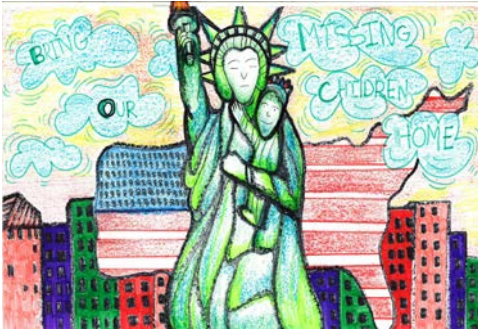
2012 Winning Entry

“The reason why I created my poster is because, I want missing children to know that someone would put effort and time to send a message for them, and for the missing children to know, that someone out there really cares that they’re missing! My poster, as you can see, has the Statue of Liberty on it with a child in her arms because the Statue of Liberty stands strong for the law which protects the children of America. Also on my poster there is the United States with the flag on it and in the flag where the stars are supposed to be, there are stick figures of the abducted children of the U.S. Plus the buildings are very bright because the children bring light to the States of America.”