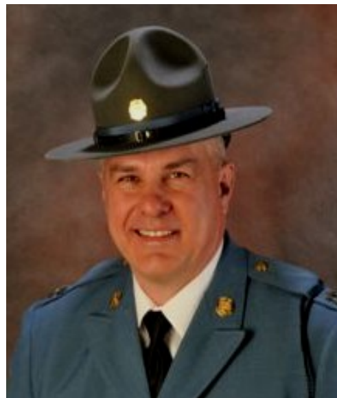
Division Director Captain