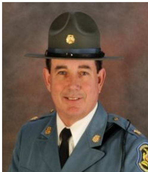
CJIS Systems Officer Major