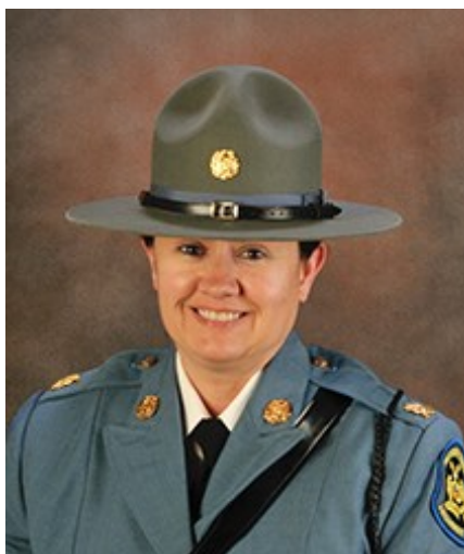
CJIS Systems Officer Major