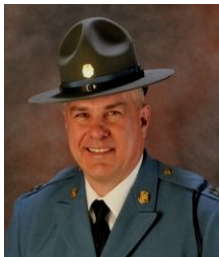
Division Director Captain